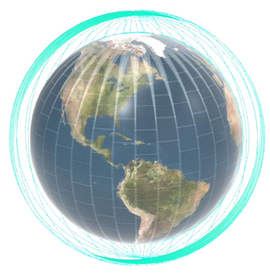
882 LEO satellites will operate at an orbit of 1,200km above the earth